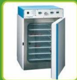
CO 2 INCUBATOR