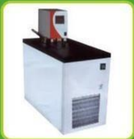
WATER AND OIL BATH CIRCULATOR