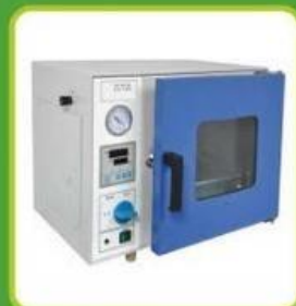
HOT AIR & VACUUM OVENS