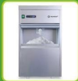
LABORATORY CHILLER & ICE FLAKES MACHINE