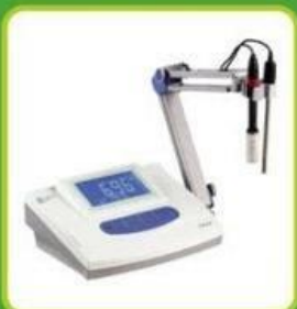
DIGITAL pH METER