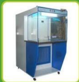
LAMINAR AIRFLOW CHAMBER