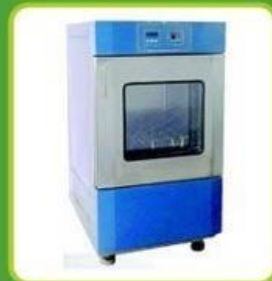
ORBITAL SHAKING INCUBATOR